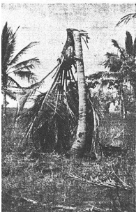
TOWNSVILLE'S LONE AIR RAID "CASUALTY"

The third raid on Townsville occurred in the early hours of 29 th July when a single flying boat again attacked the city, dropping seven bombs into the sea and an eighth which fell on an agricultural research station at Oonoonba, damaging a coconut plant. This aircraft was intercepted by four Airacobras and was damaged. The fourth raid on north Queensland occurred on the night of 31 st July when a single flying boat dropped a