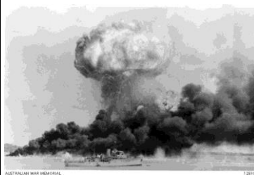
Dense clouds of smoke rise from oil tanks hit during the first Japanese air raid on Australia's mainland. In the foreground is HMAS Deloraine, which escaped damage

The Attack on Darwin - On 19 th February 1942 the Japanese mounted the first and the largest attack against mainland Australia by bombing Darwin. Four Japanese aircraft carriers ( Akagi , Kaga , Hiryū and Sōryū ) launched a total of 188 aircraft from a position in the Timor Sea inflicting heavy damage on Darwin and sinking eight ships. Later the same day a raid conducted by 54 land-based army bombers inflicted further damage on the town and RAAF Base Darwin and resulted in the destruction of 20 military aircraft. Allied casualties were 235 killed and between 300 and 400 wounded, the majority of whom were non-Australian Allied sailors. Only four Japanese aircraft (all navy carrier-borne) were confirmed to have been destroyed by Darwin's defenders.