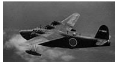
Japanese Kawanishi H8K1 "Emily" naval flying boat

bomb which exploded near a house outside of Mossman, injuring a child.