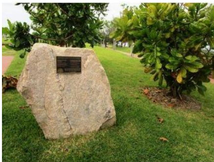
Catalina A24 24 Memorial Plaque

On 17 August 1943, Catalina, A24-24, of 20 Squadron RAAF, took off from Bowen on an air to sea gunnery training exercise flight. At the conclusion of firing practice, the aeroplane was